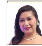
Soci Ame Patagani-Viking Community Service